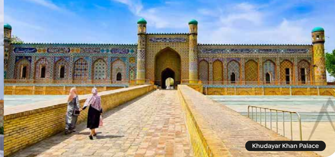
Khudayar Khan Palace