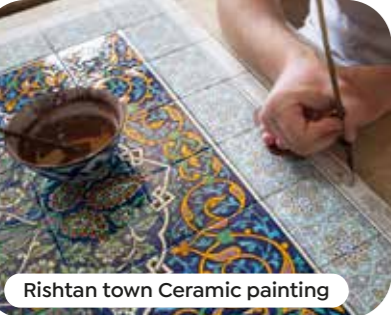
Rishtan town Ceramic painting