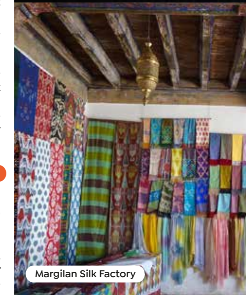
Margilan Silk Factory