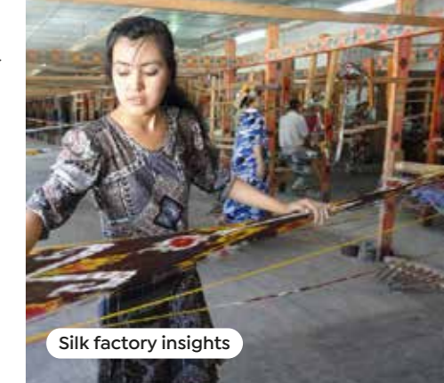
Silk factory insights