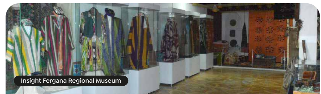
Insight Fergana Regional Museum

Note: An overnight bag is recommended for your night stay in Fergana Valley.