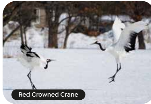
Red Crowned Crane