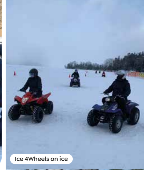
Ice 4Wheels on ice