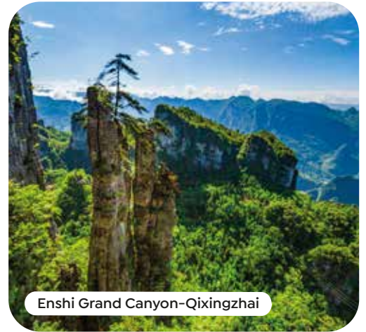
Enshi Grand Canyon-Qixingzhai

Visit Enshi Grand Canyon - Qixingzhai (eco-friendly car + up cable car + down escalator), is called the "Natural Museum of Karst Topography". Then visit the Three Gorges Folklore Performing Arts City .