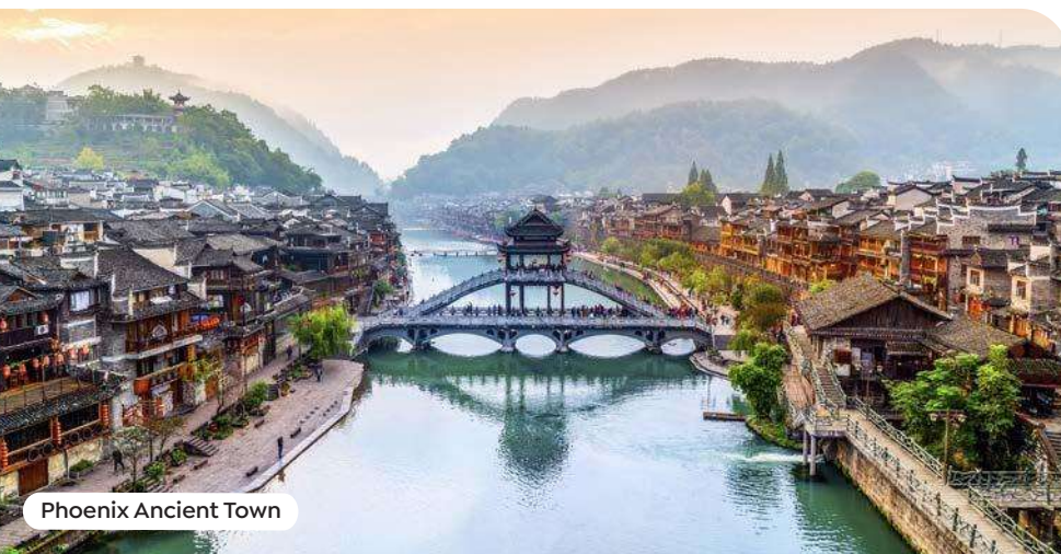
Phoenix Ancient Town