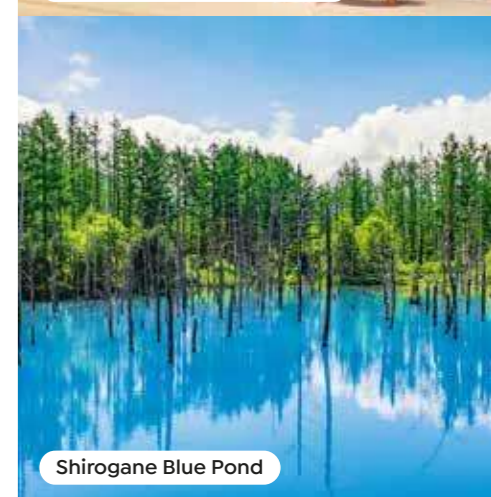
Shirogane Blue Pond