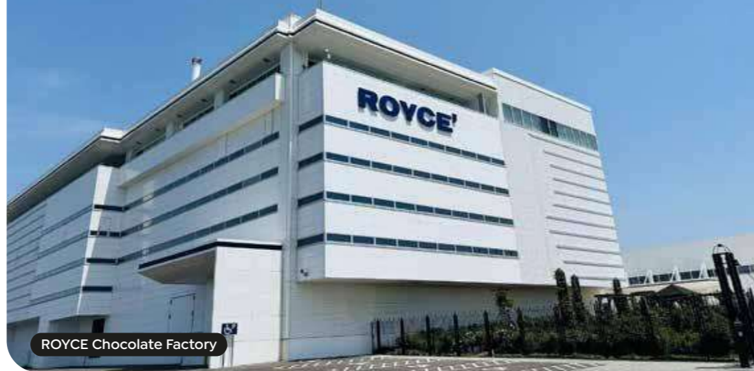
ROYCE Chocolate Factory