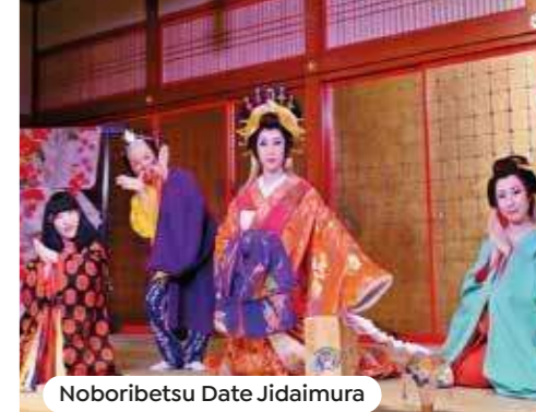
Noboribetsu Date Jidaimura