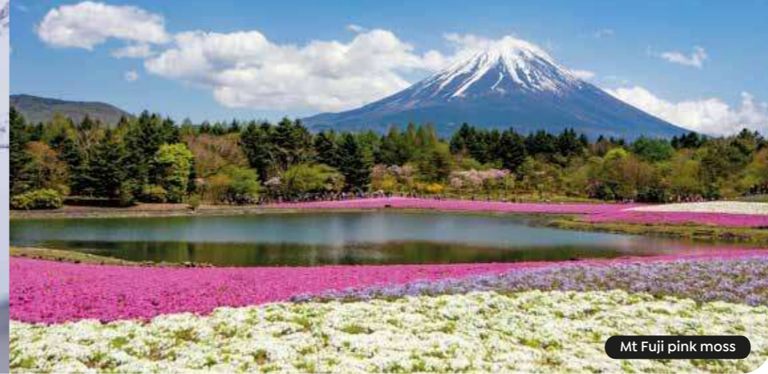
Mt Fuji pink moss