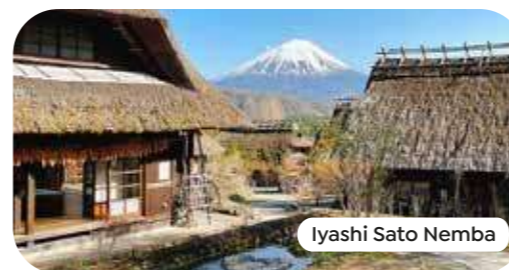
Iyashi Sato Nenba