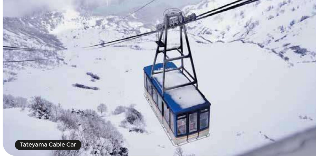
Tateyama Cable Car