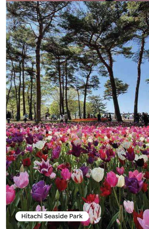
Hitachi Seaside Park