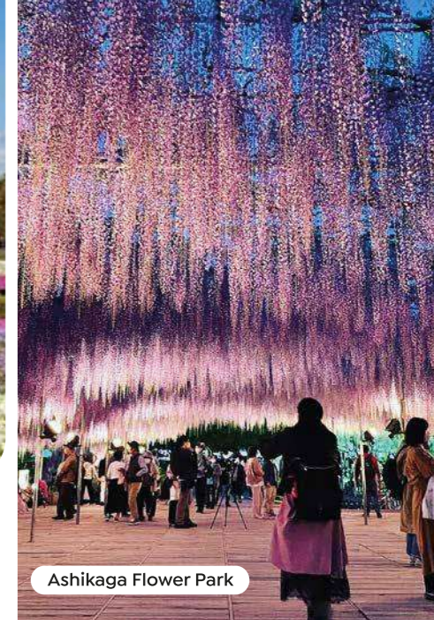
Ashikaga Flower Park