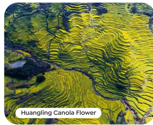
Huangling Canola Flower