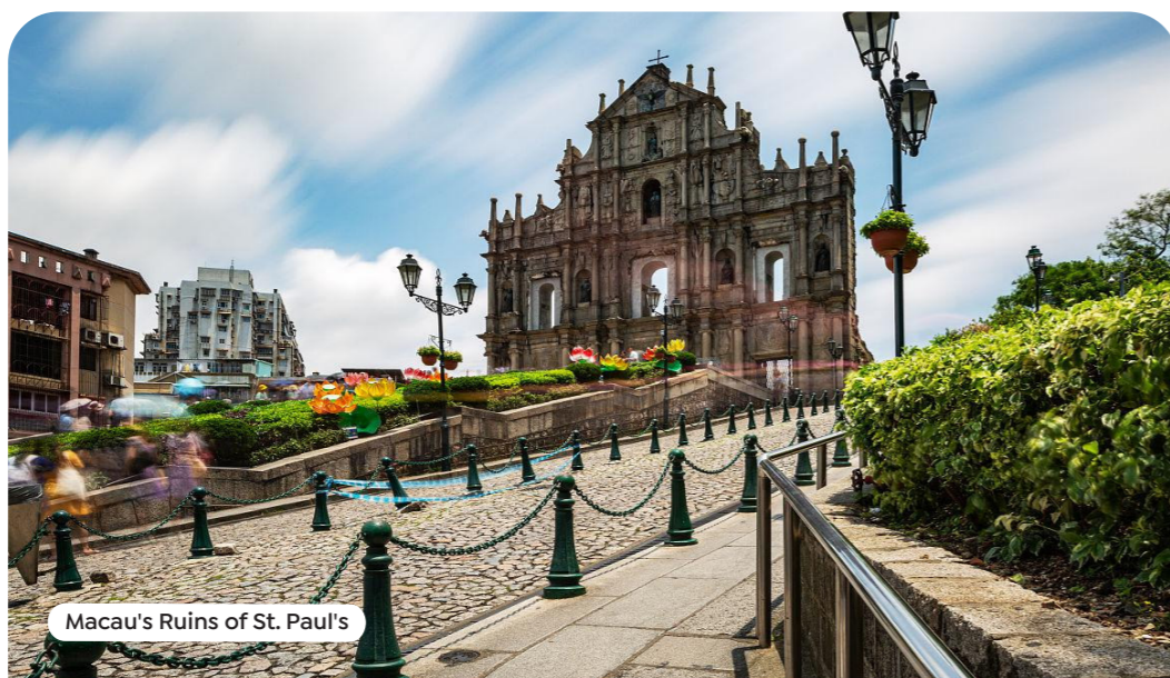
Macau's Ruins of St. Paul's

Commonwealth Travel Service Corporation Pte Ltd 大通旅游 (新加坡) 机构有限公司 101 Upper Cross Street #02-67/68/69 People's Park Centre Singapore 058357