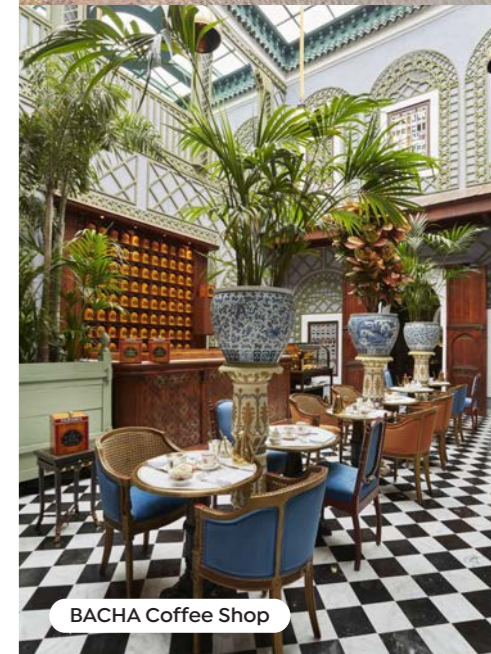
BACHA Coffee Shop