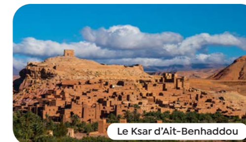
Le Ksar d'Ait-Benhaddou