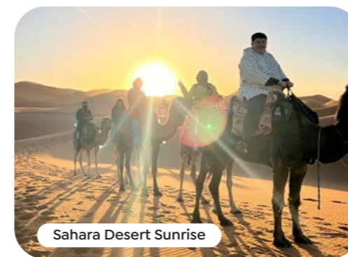
Sahara Desert Sunrise