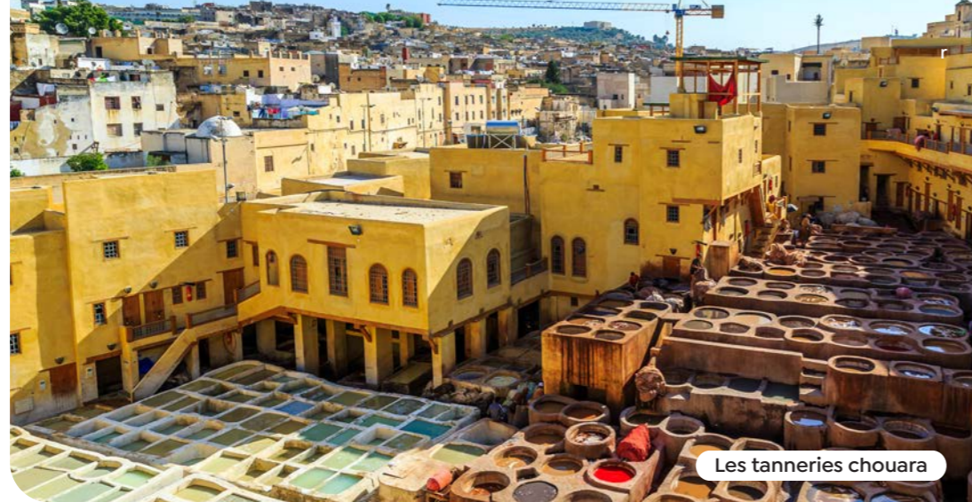
Les tanneries chouara