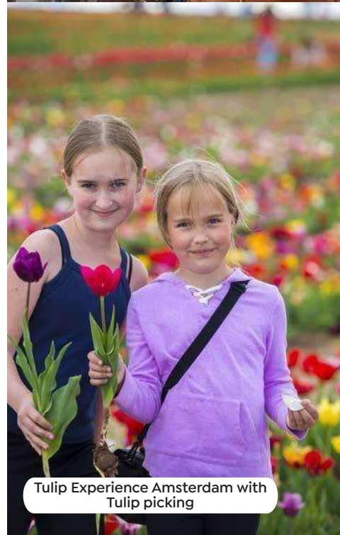
Tulip Experience Amsterdam with Tulip picking