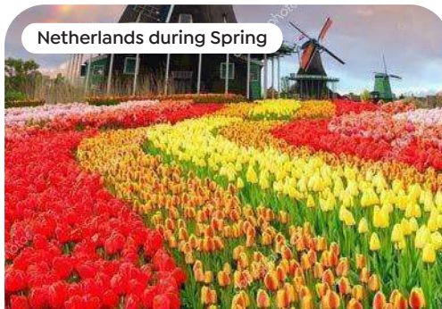
Netherlands during Spring