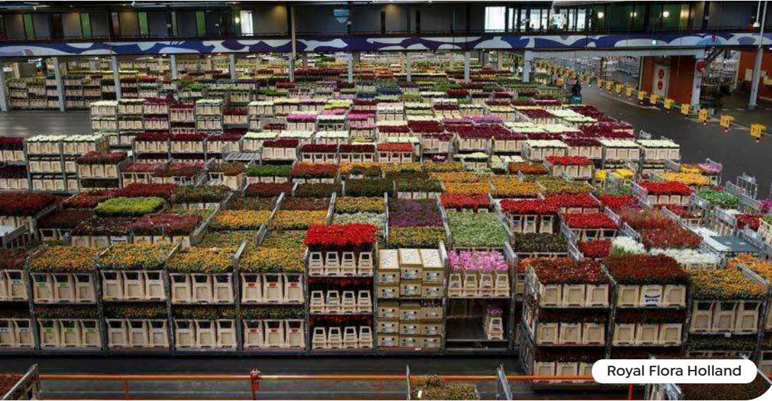
Royal Flora Holland

political life in The Netherlands. This is the place where the most important events in Dutch history took place, but also where the future is made.