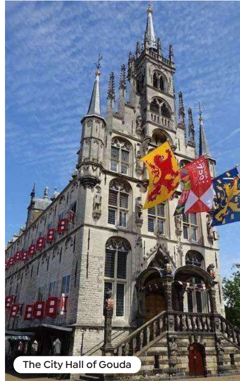
The City Hall of Gouda