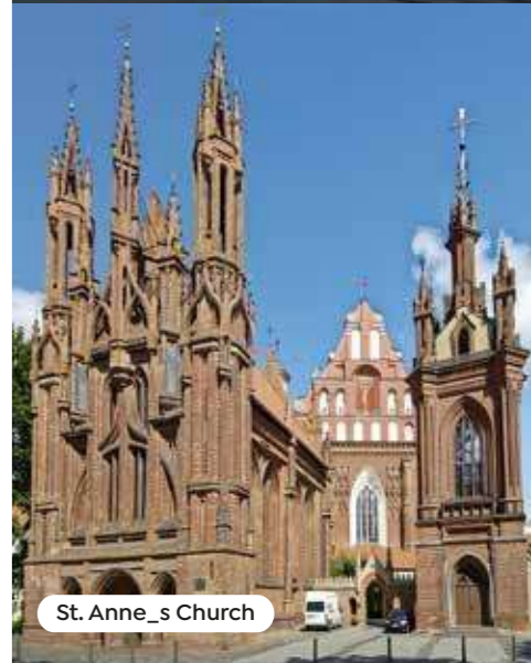
St. Anne's Church