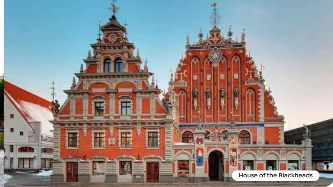
House of the Blackheads

Start your day with a city tour around the port city and explore the Karosta , the only military prison in Europe open for tourists and former largest military garrison in the Baltics, a peculiar blend of military brutality and ornate end-of-19th century architecture. Next, visit Holy Trinity Cathedral and The Naval Orthodox Cathedral of Saint Nicholas before making your way to Riga , capital city of Latvia, known for its wooden buildings, art nouveau architecture and medieval Old Town which listed under UNESCO World Heritage in 1995. If time permits, do not miss an opportunity to sail along the Daugava River at your own expenses.