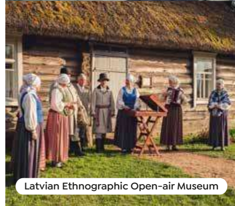
Latvian Ethnographic Open-air Museum