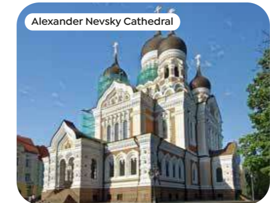
Alexander Nevsky Cathedral

century and largest. Thereafter, proceed to visit St Olaf's Church , its history backdated to the 12th century not forgetting Freedom Square in Tallinn. After which, proceed up the Tallinn TV Tower observatory deck where you will be able to see the panoramic view of Tallinn city.