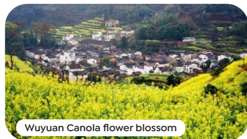
Wuyuan Canola flower blossom