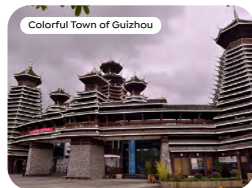
Colorful Town of Guizhou