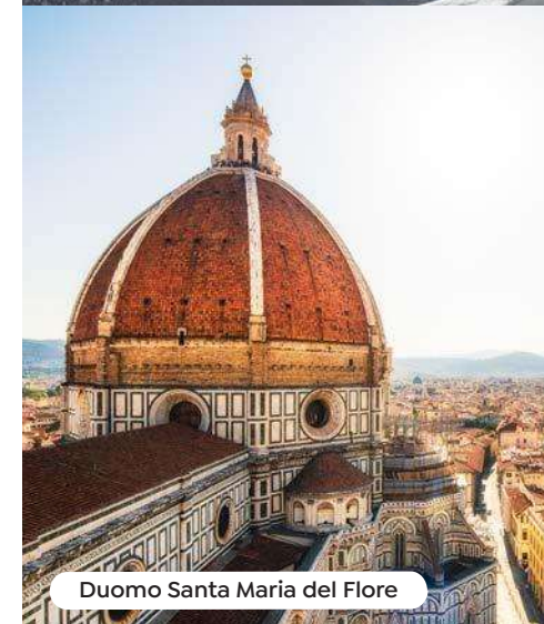
Duomo Santa Maria del Fiore