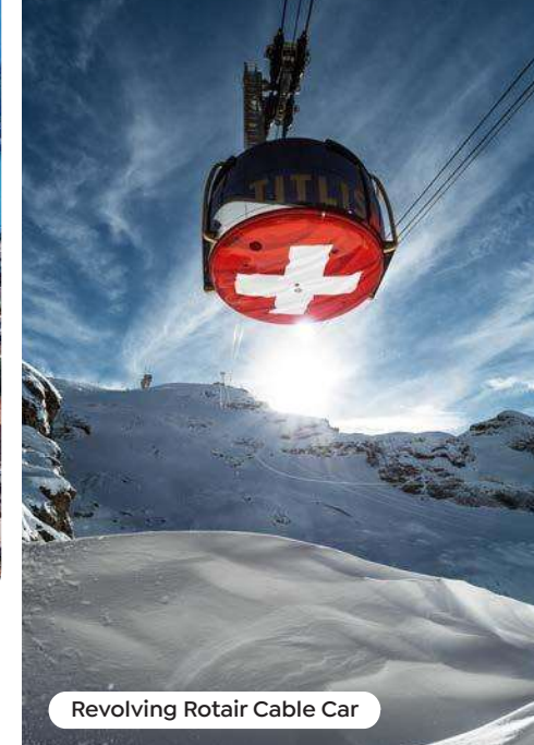
Revolving Rotair Cable Car