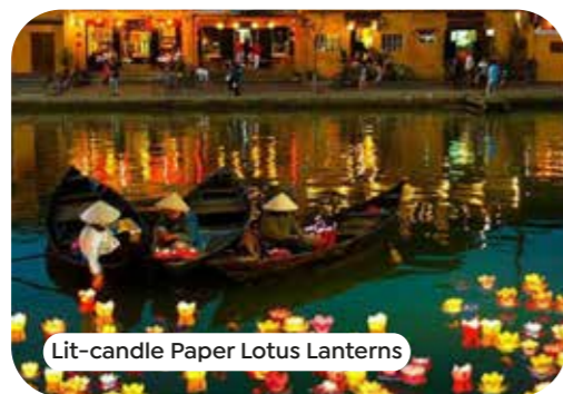
Lit-candle Paper Lotus Lanterns