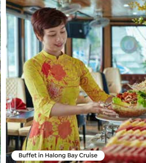
Buffet in Halong Bay Cruise