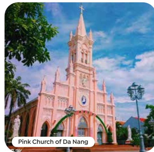
Pink Church of Da Nang