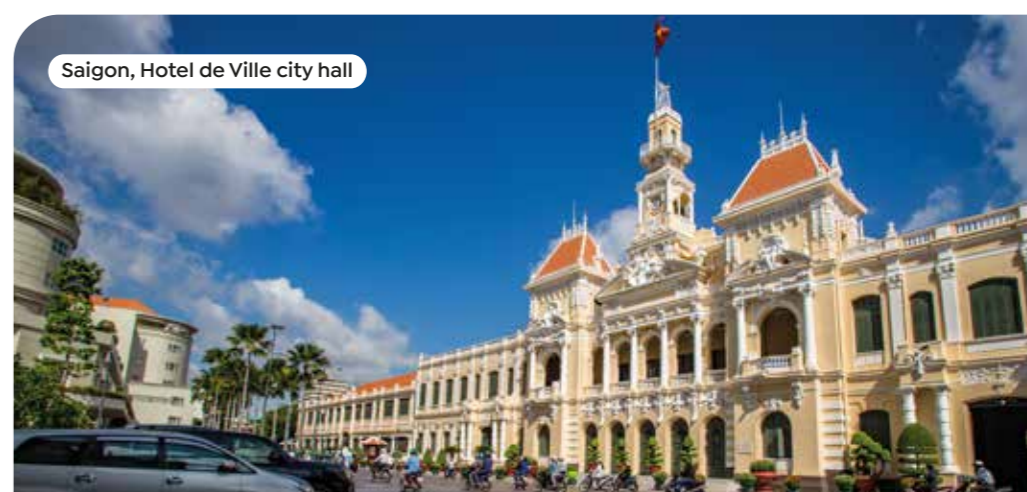
Saigon, Hotel de Ville city hall