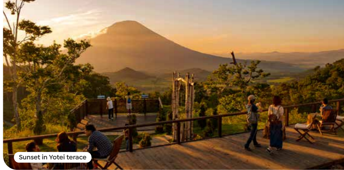
Sunset in Yotei terrace