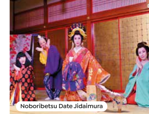
Noboribetsu Date Jidaimura