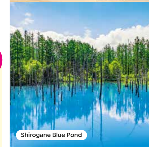
Shirogane Blue Pond