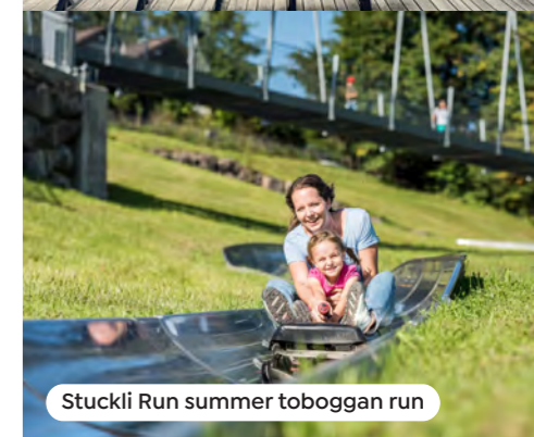
Stuckli Run summer toboggan run