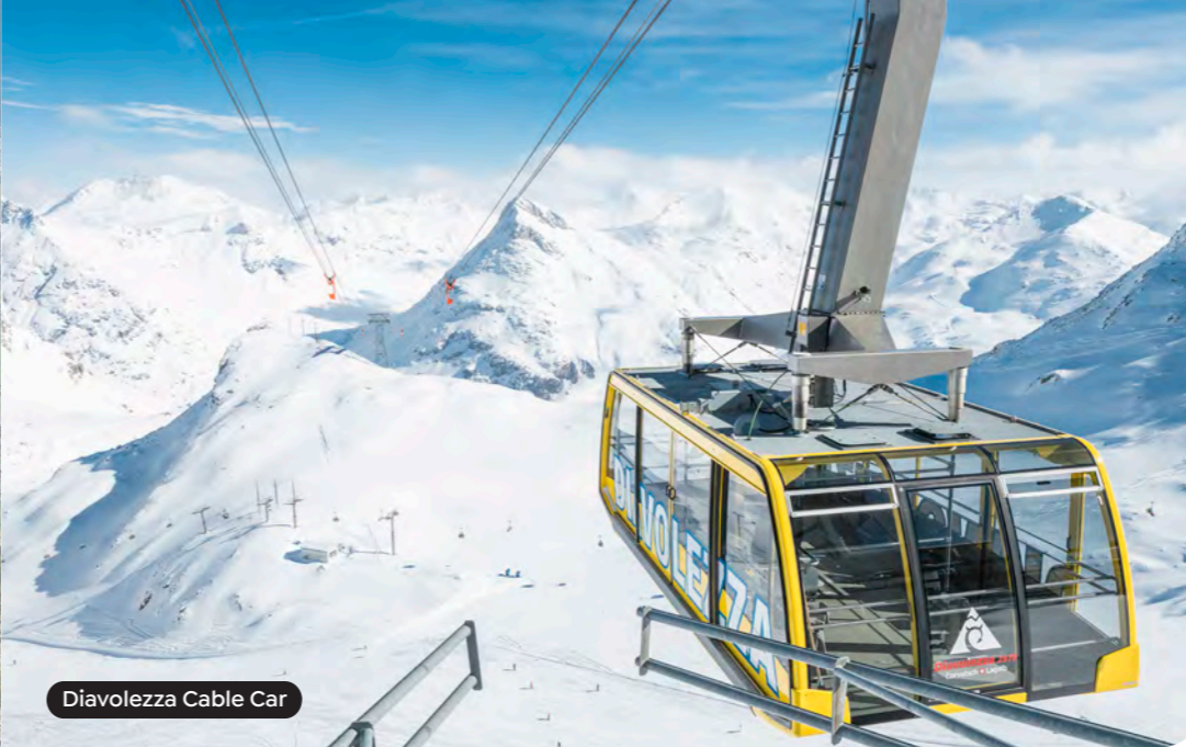
Diavolezza Cable Car