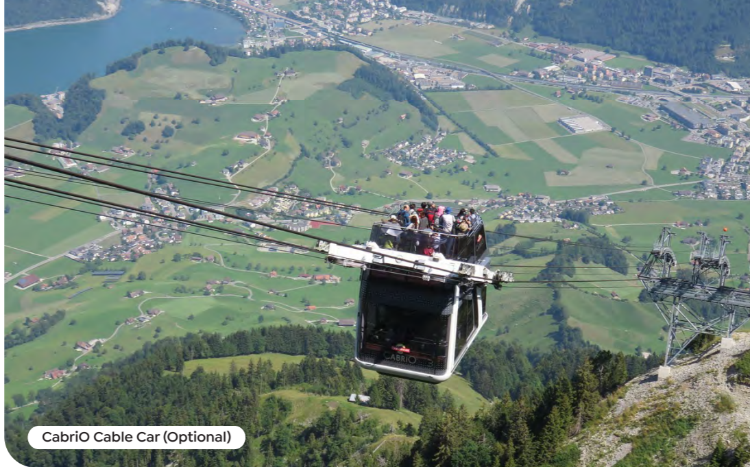
Cabrio Cable Car (Optional)