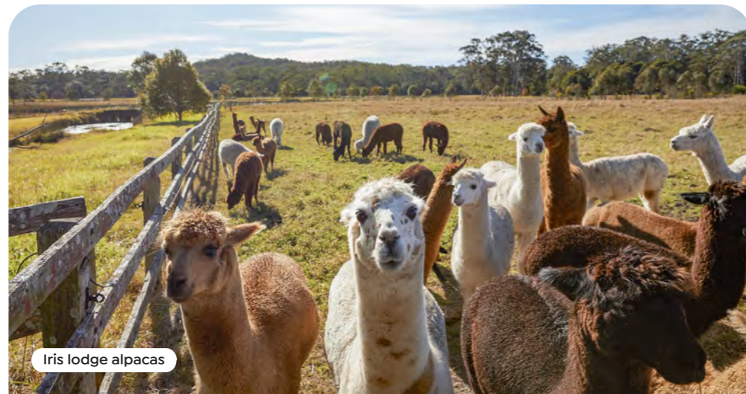
Iris lodge alpacas