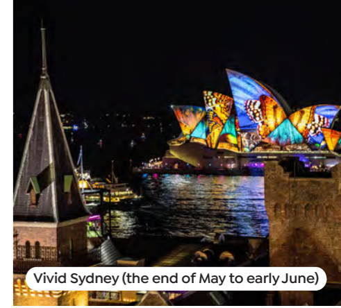
Vivid Sydney (the end of May to early June)