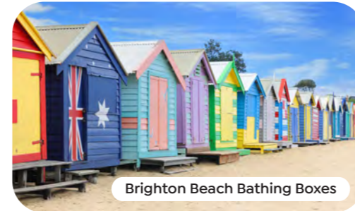
Brighton Beach Bathing Boxes