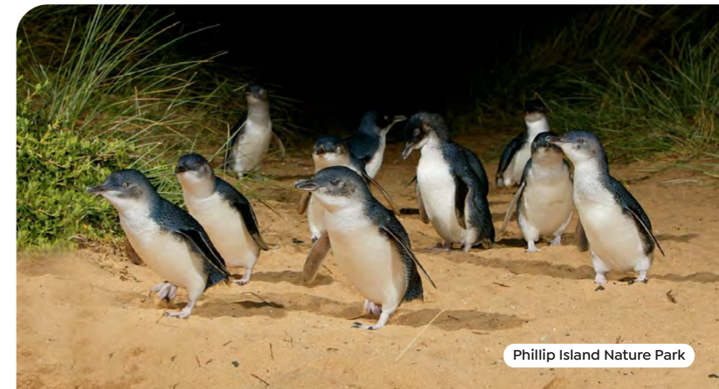
Phillip Island Nature Park