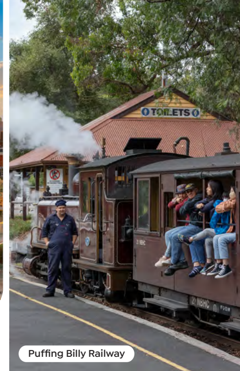
Puffing Billy Railway