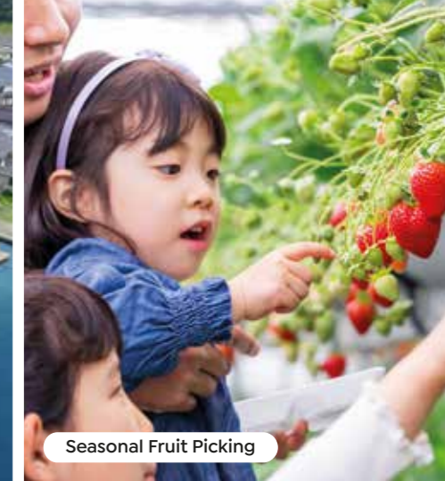
Seasonal Fruit Picking