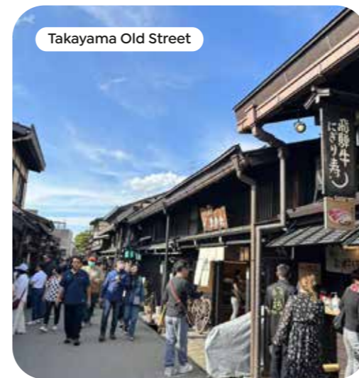
Takayama Old Street