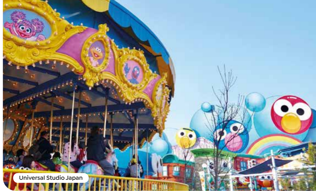
Universal Studio Japan