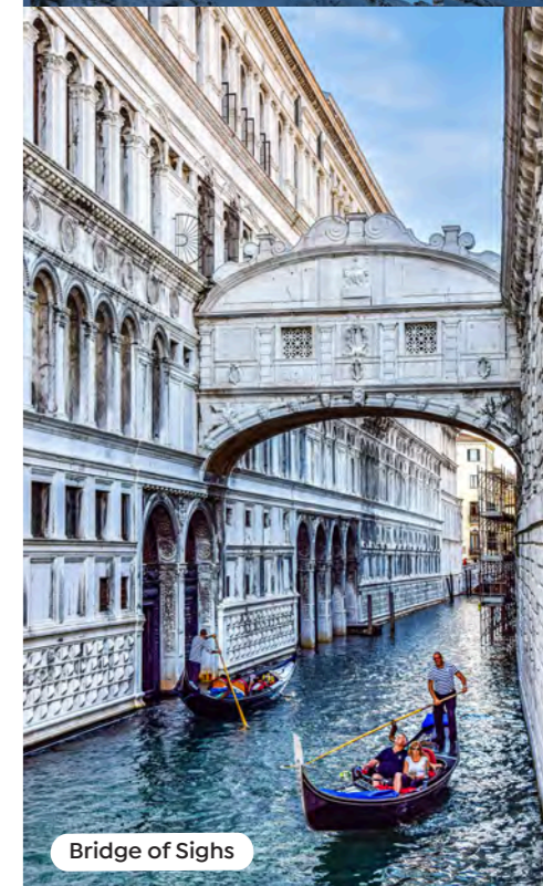
Bridge of Sighs